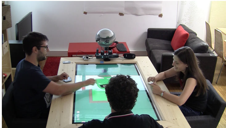
Figure 3: Sueca scenario in the trust experiment.

Our first case-study that focuses on group-based emotions in social robots is based on a tabletop card game, named Sueca 2 . This is a very popular Portuguese card game that is played by four players that are divided in two teams. The first version of this scenario was developed in the PARCEIRO project 3 , with the aim of understanding how much people would trust a robot partner they had interacted before compared to a robot partner they never interacted with. An experiment was conducted where several groups of three participants played Sueca with the EMYS robot for about an hour (see Figure 3), with one of them being randomly assigned to be the robot’s partner. The obtained results showed evidence that the scenario was able to increase how much trust was attributed to the robot, but only for the group of participants that had a previous interaction with it [12].