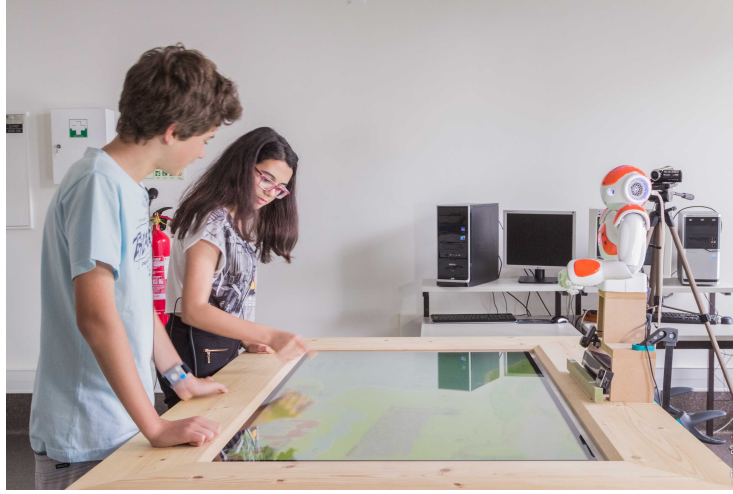
Figure 1: Sustainability Scenario in EMOTE.

most common for questions, and smiles appear usually after positive feedback. In conclusion, this study shows that the behavioural responses that children express reveal engagement with an empathic social robot, which could either be understood as a developing social bond (e.g., [36] [26]) or a reaction to perceiving the robot as a social actor [35] [48].