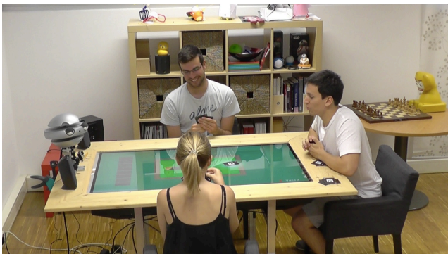
Fig. 1 Experimental setting for Study 1.

We recruited a total of 30 university students (17 males and 13 females) with ages ranging from 19 to 42 years old ( M = 23.03 ; SD = 4.21 ). Among the participants, 56.7% had a high level of expertise in the game, 40% had a moderate level of expertise, and only 3.3% had never played the game before. Regarding previous interactions with the EMYS, 24 participants had previously interacted with it, and 6 were interacting with it for the first time.